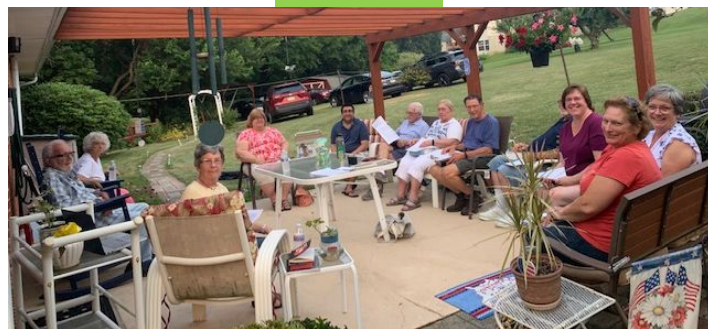
Tuesday night's class, 'Fail: What to do When Things Go Wrong'.