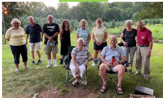
Thursday night's class, 'A New Reformation'.