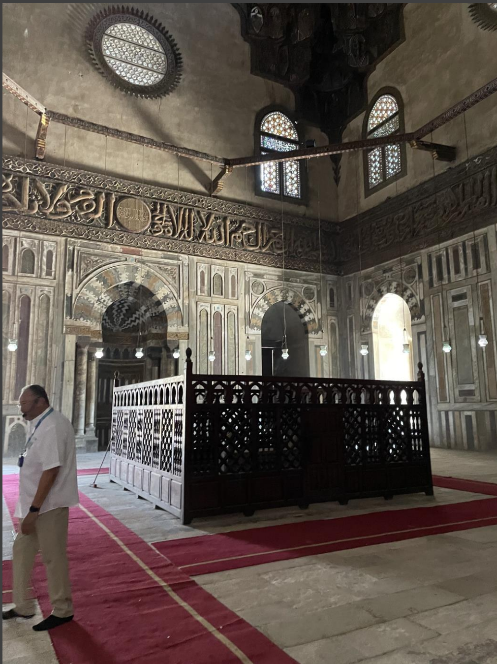
Call to Prayer Mosque of Sultan Hussan Cairo, Egypt