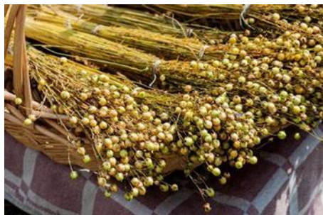
Flax prepared for drying

Rahab, a harlot, apparently kept up with the news. She knew about the dry passing at the Red Sea and about the demise of the two kings of the Amorites. The mighty acts of God convinced her that Jericho was doomed. So, she lodged the two Hebrew spies. When someone snitched on her, she hid the spies under the flax drying on the roof. Once the immediate danger had passed by Rahab - giving the authorities a false trail to follow – she negotiated her own terms with Joshua's spies.