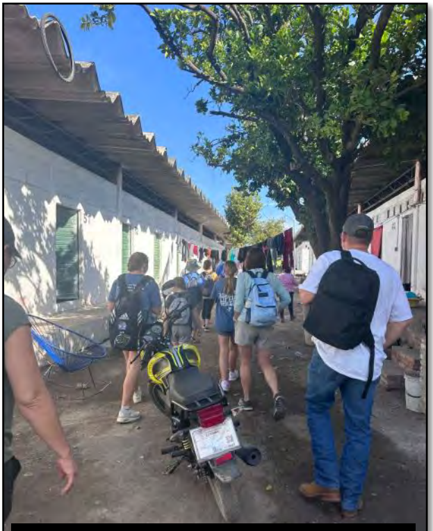
Learning about living conditions in the migrant camp.