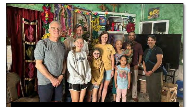
Spending time with a family in their home in the migrant community La Estacion.

I'd like to think that everything in our Ministry Action Plan for 2024 and beyond could generate such amazing and life changing results. I believe our St. John's community has never been more clear about our purpose, the behaviors we engage in as we pursue our purpose, and the strategic processes we execute to achieve our purpose. I wonder how we can help the organizations we support – near and far – to be equally clear about their purposes, behaviors, and processes, so that all investments yield transformative results like those we see in Mexico - the good Lord willing and the creek don't rise.