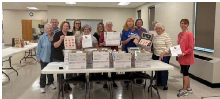
Care packages were sent to our college students during finals week. Many thanks were expressed by grateful students receiving the boxes filled with nourishing treats and words of encouragement during a stressful time!